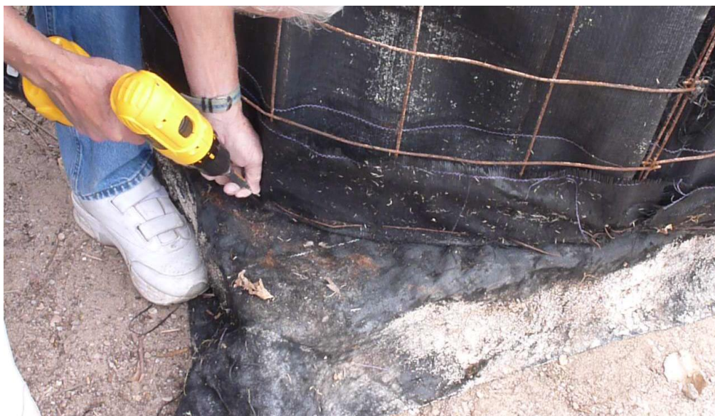
Figure 5. Screwing the Base of the Cage to the Pallet