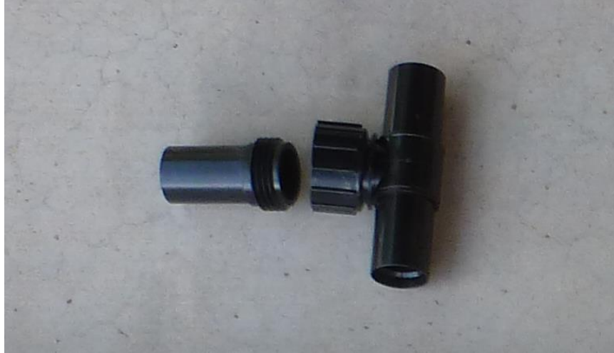
Figure 9. T-hose Fitting for the Irrigation System

The irrigation system adds sufficient water to the bioreactor when attached to a garden hose or typical ½” landscape irrigation hose with water pressure between 30-50 psi. It is best to hook this hose up to a timed sprinkler system (timed to irrigate the reactor 1 minute/day, or 2 minutes/day in temperatures above 100 °F) to ensure that the pile has adequate water and is not allowed to dry out.