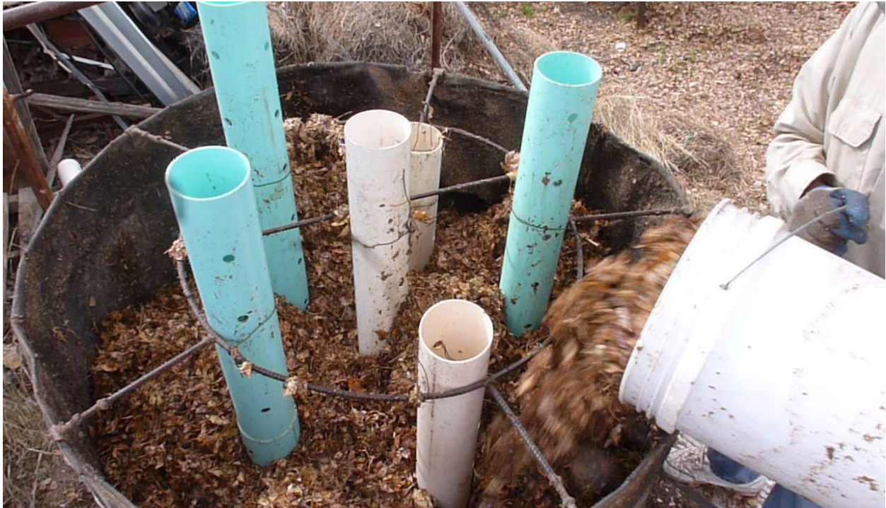
Figure 7. Filling the Bioreactor

Typically, I fill 6-9 buckets with wetted compost, dump each of these buckets into the bioreactor, then fill another 6-9 buckets and repeat the process.