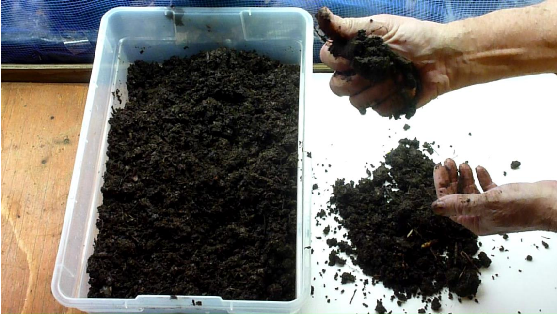
Figure 10. Mature Compost from a Johnson-Su Bioreactor. See also the video at https://www.dropbox.com/s/2fhy9zex8f3345j/P1040302.MOV?dl=0 .

After a composting period of 9 months to a year, the compost product from a Johnson-Su bioreactor (Figure 10) can be used as it is, made into a slurry to coat seeds, or used to make an extract that can be sprayed on a field or into the furrow as you plant seeds.