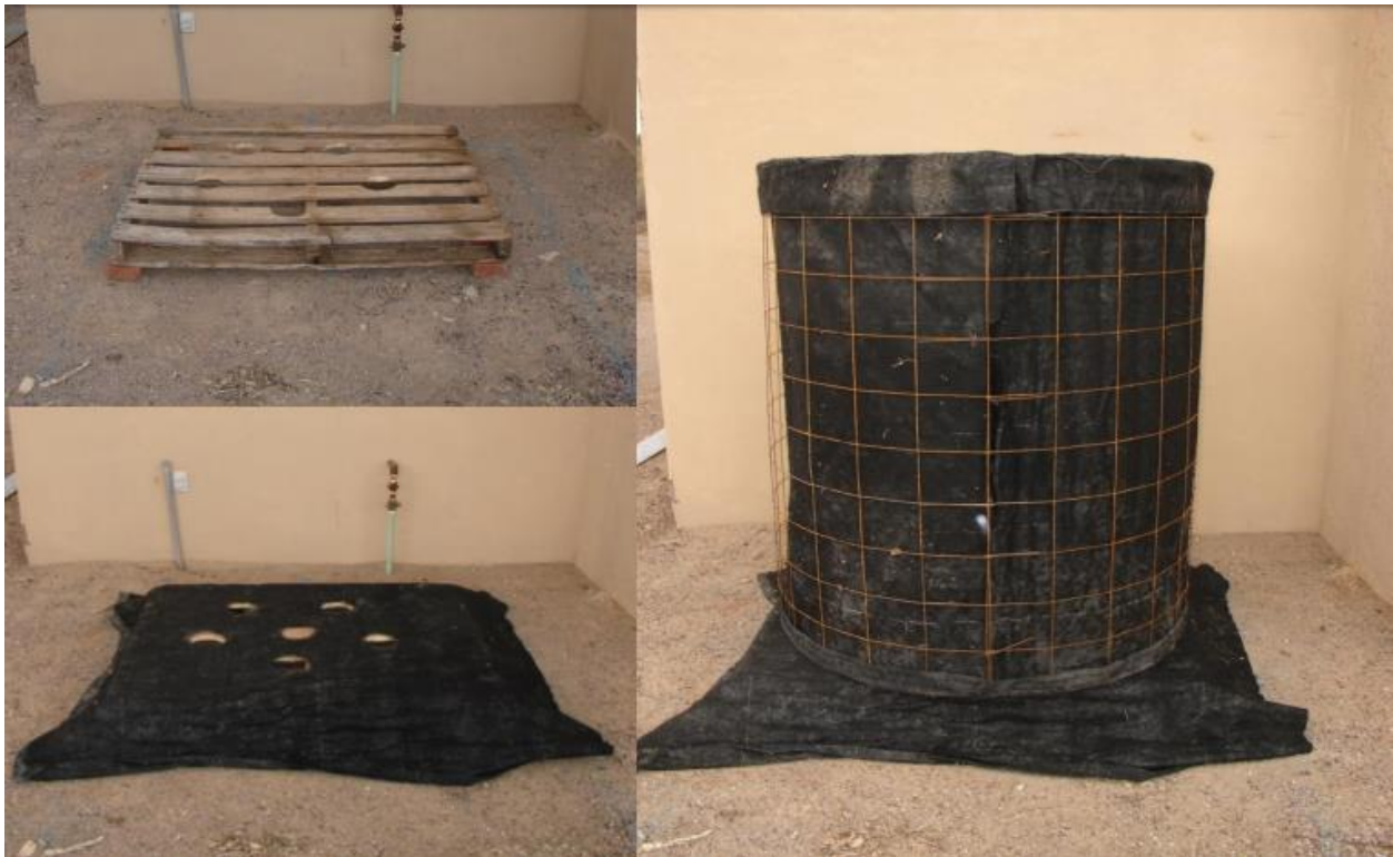
Figure 2. A Johnson-Su Composting Bioreactor

After you build a Johnson-Su bioreactor (Figure 2), you can reuse it many times.