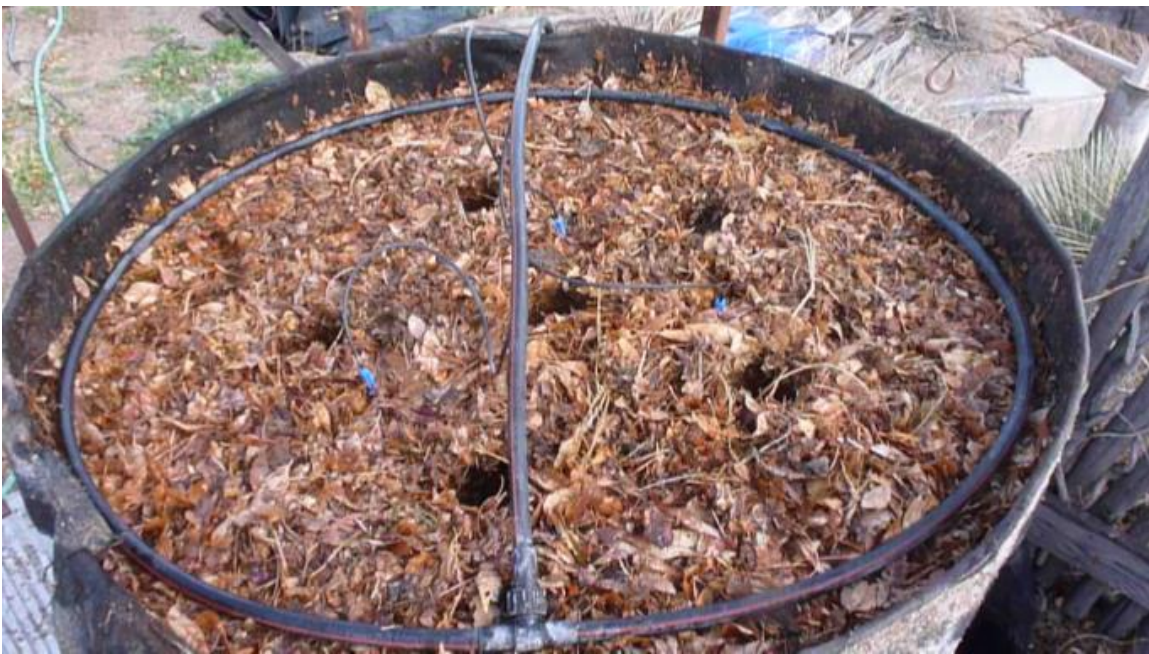
Figure 8. Irrigation System for a Johnson-Su Composting Bioreactor

To irrigate the system, I use a circular piece of \frac{1}{2} " landscape hose that snakes around the top perimeter of the bioreactor (Figure 8). I drill \frac{1}{16} " holes into the bottom of the hose every 4-5", and also I drill some holes horizontally in the hose about every 6". The horizontal holes spray towards the center of the bioreactor to thoroughly wet all the material. I connect the ends of this hose with a plastic landscape T-hose fitting that has two \frac{1}{2} " female push-compression fittings and a female hose-bib thread (Figure 9). Once the water has been sprayed onto the top of the compost substrate, gravity will pull the water from the top of the pile into the rest of the compost substrate.