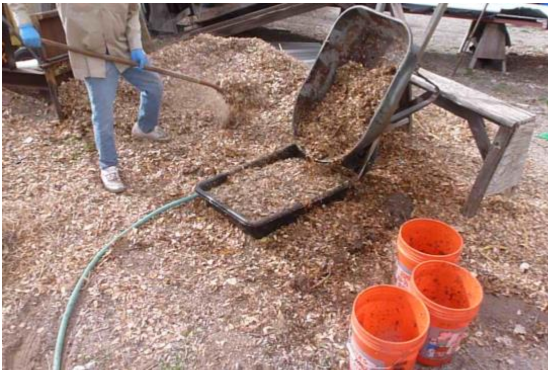
Figure 6. Setup for Wetting Feed Materials

Once the feed materials are thoroughly wet, I use a pitchfork to lift them into a wheelbarrow that is braced into a tilted position (Figure 6) so that water can drain off of the feed material and back into the water-bath tray. This uses the water efficiently.