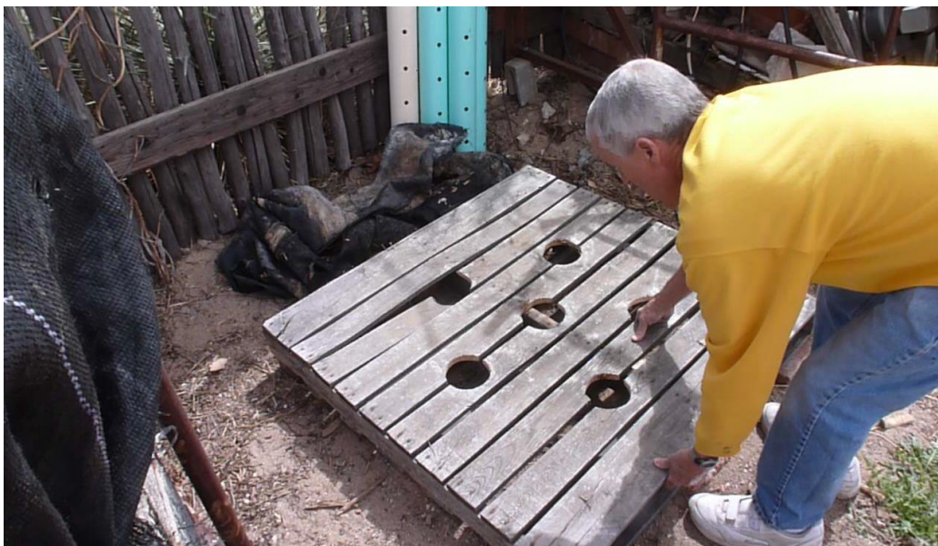
Figure 3. Positioning of Holes in Pallet

The pallet serves as the base for the Johnson-Su bioreactor, and it supports both the remesh/groundcloth cylinder and the septic system drain field pipes. To let the pallet hold the pipes in place, you'll use a jigsaw to cut six 4 3/8" holes in the top of the pallet (as shown in Figure 3).